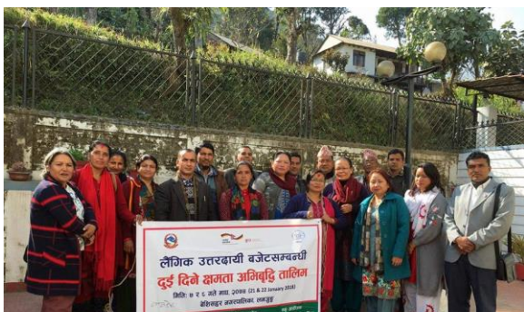
WHR organized Capacity building workshop on "Gender Responsive Budget" at Lamihung