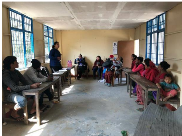
WHR organized Community Consultation at Kadambas and Kunchwok of Sindhupalchwok.district.