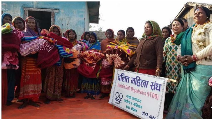
WHR Kailali with the coordination with Red Cross distributed 200 blankets to Single Women, Senior Citizens and Vulnerable children.